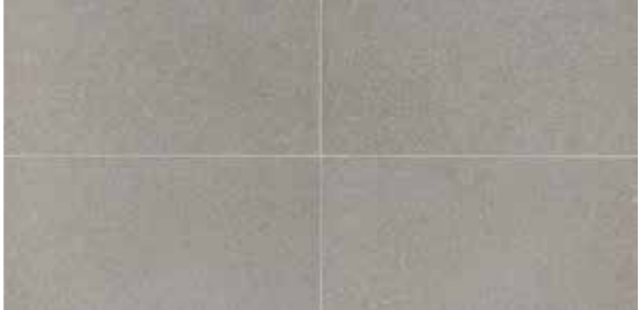
LIGHT GRAY NE03