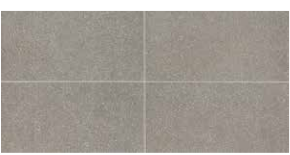
MEDIUM GRAY NE04