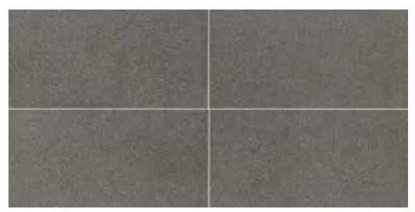
DARK GRAY NE05