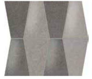
COOL UNIVERSAL NE07 (12.5% Light Gray NE03 Matte, 12.5% Light Gray NE03 Light Polished, 12.5% Medium Gray NE04 Matte, 12.5% Medium Gray NE04 Light Polished, 25% Dark Gray NE05 Matte, 25% Dark Gray NE05 Light Polished)